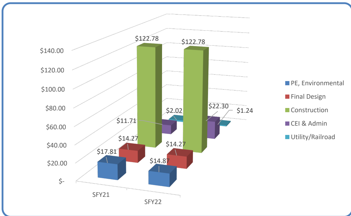
Figure 10-1. Project Expenditure & Cost Estimate Comparison by Activity (in $ millions)

The actions taken to monitor, and control cost growth include vetting all changes internally between the Project team and the respective Departments. Items considered are cost, added value, short and long-term maintenance impacts, impacts to the Project schedule, and the ability to be implemented. The Project team will look for duplication of efforts and items to control cost growth. All consulting agreements and amendments are negotiated by INDOT's Professional Services Department in accordance with the 2020 INDOT Standard Specifications.